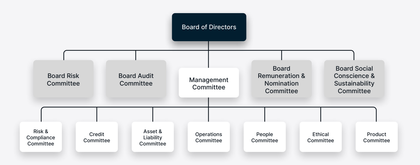
Figure 1 Governance structure

The Board Risk Committee, the Board Audit Committee, the Board Remuneration & Nomination Committee and the Board Social Conscience and Sustainability Committee are all sub-committees of the Board.